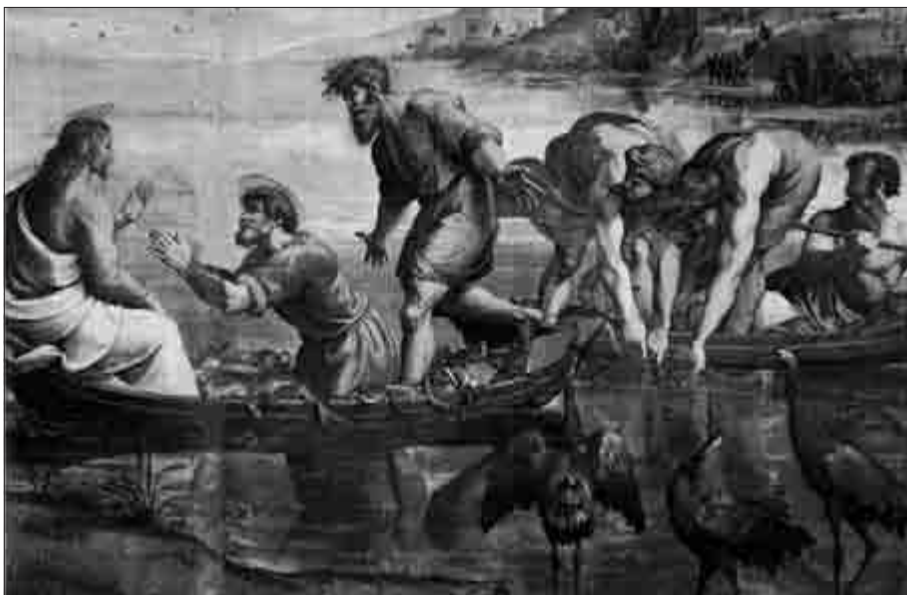
Raphael (1483–1520) “The Miraculous Draught of Fishes.” The miracles recorded in Scripture became a stumblingblock for liberal scholars. Not being able to bring themselves to believe these fantastic reports of God’s supernatural intervention in the realm of the natural, they simply changed rules, redefining faith so that it became an irrational leap of faith . Unfortunately (for them), God continues to play by the rules. To be saved, you still have to examine the evidence, assess the logic, repent, and believe the Gospel of Jesus Christ. ■

Having said all this, I now come to a point I treat elsewhere in this issue. (See “Do You Believe the Gospel of Jesus Christ?”) The logical question one should ask regarding pistis (belief) is, “persuaded by what evidence?” The answer found in the New Testament is other than one might expect. ■