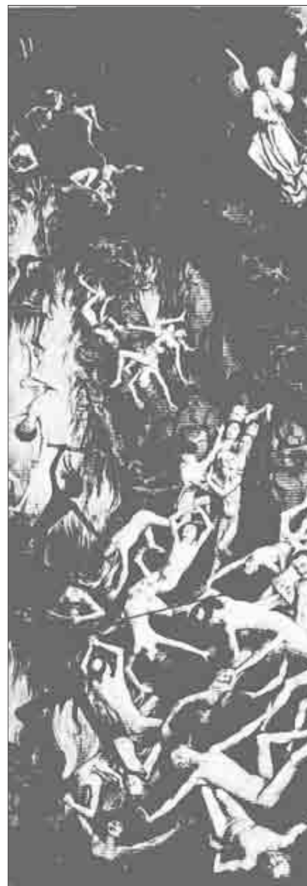
Hans Memling, (1430/40–1494) “The Last Judgment.”

And at that time many will fall away and will deliver up one another and hate one another. And many false prophets will arise, and will mislead many. And because lawlessness is increased, most people’s love will grow cold. But the one who endures to the end, he shall be saved. And